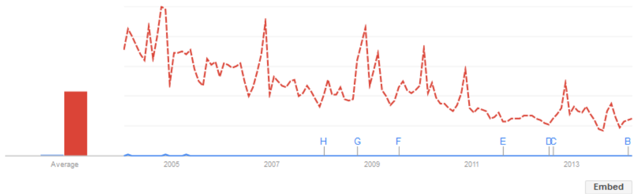
Figure 1. Graph deception of average news coverage of United States Senate (Red) vs California State Senate (Blue) 3

Literature in this review has shown a significant relationship between competitive districts and legislator behavior. While most research has been conducted on the congressional level there has been limited research done specifically on state legislators. Past literature has covered the policy responsiveness of many national representatives however because of the lack of research done specific to state legislators behavior in response to competitive districts creates a need for research in this area. The need for additional research is only intensified with the issue of the low-information environment found in state districts. The low information environment draws into question the application of research done on national level to state legislators.