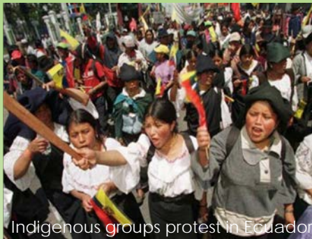
Indigenous groups protest in Ecuador

To protect emerging democracies, many scholars and practitioners recommend political power-sharing institutions, which aim to safeguard minority group interests. Yet little empirical evidence exists to support that recommendation. Filling that gap are Kaare Strom of Political Science and two co-authors. In the