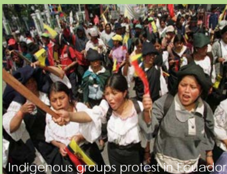
Indigenous groups protest in Ecuador

To protect emerging democracies, many scholars and practitioners recommend political power-sharing institutions, which aim to safeguard minority group interests. Yet little empirical evidence exists to support that recommendation. Filling that gap are Kaare Strom of Political Science and two co-authors. In the